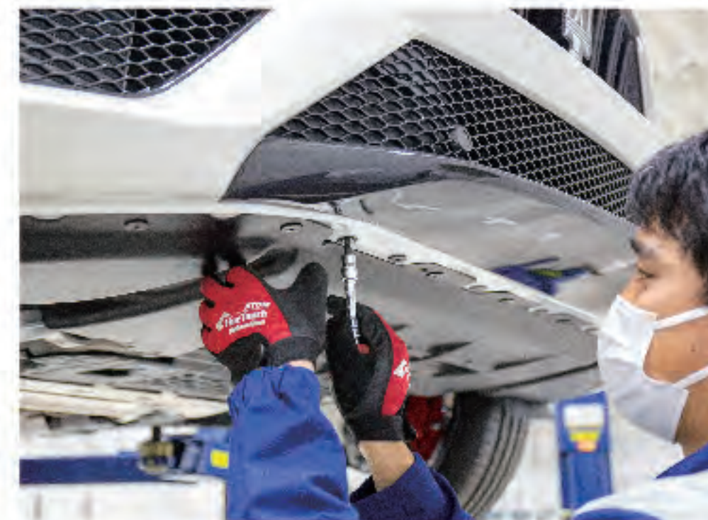
With their hawk eyes, the experienced inspectors and technicians don't let even the tiniest defect left untreated.