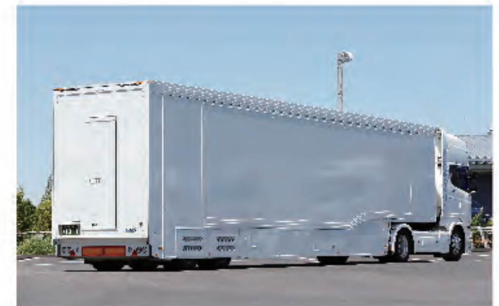
All the transporters are painted in white.