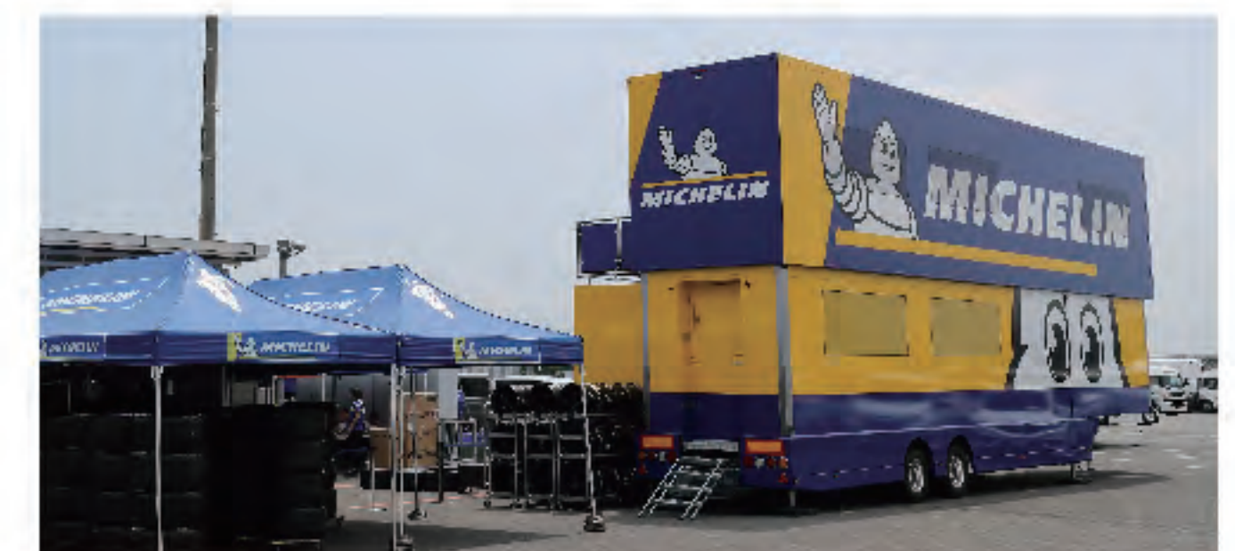
Outreaching the limit of transporter: It serves as a "mobile workshop" (Michelin Tyre Japan).

Motorsport Operation is one of the core business divisions of TransWeb. We have been involved in the racing industry since our inauguration. We have offered specialist logistics services to various teams in Super GT and Super Formula Championships and Formula One Japanese Grand Prix. The racing car is a purpose-built machine and thus looks very different from the road car. It physically differs from road-going counterpart especially (or logistically we might say) in terms of with the "ultra-low" ride height. Our transporter,