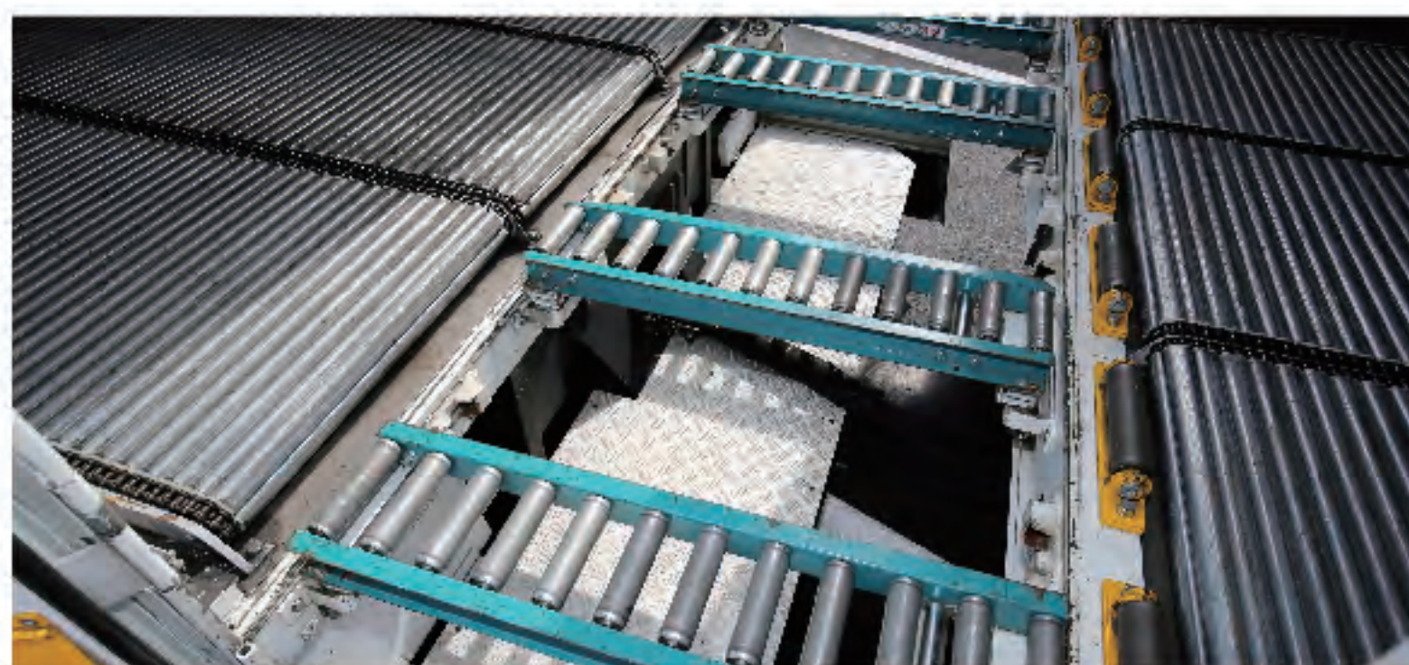
The roller mechanism over the joint between the two trailers enables push-loading from the rear-end.