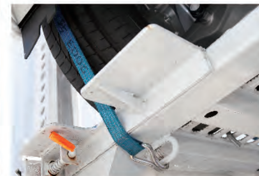
All the vehicles are tightly fixed to the transporter floor by tie-wrap belts made of special fabric.