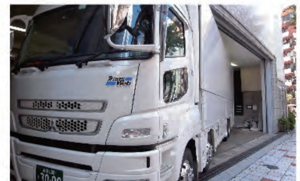
Selection of the transporter depends on the dimensions of service entrance.