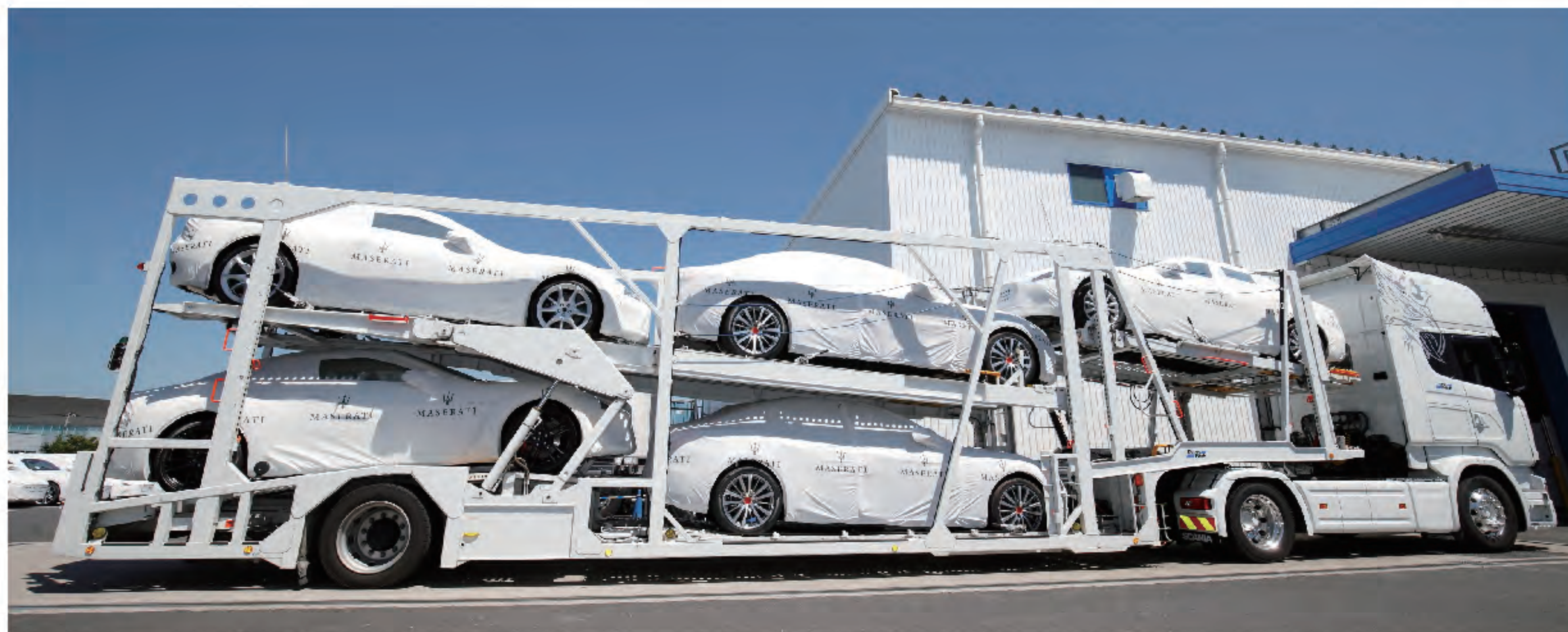
Our latest-generation open-top transporter. As is the case of the enclosed version, it is painted beautifully in white, carrying five G-segment passenger cars.

The oversized and closed transporter takes the responsibility of delivering the vehicles to the dealer network. It provides the higher level of security thanks to the fully-covered configuration. It is thus the least likely that vehicles onboard would be damaged by unauthorized party. Our latest transporter accommodates four vehicles with ease even if they are high-roof SUVs. TransWeb is entrusted by many automotive brands to transporting of new vehicles. The more achievements and experiences we gain, the greater the demand arises. We are taking the challenge in a positive manner and striving for exceeding our customer's expectation.