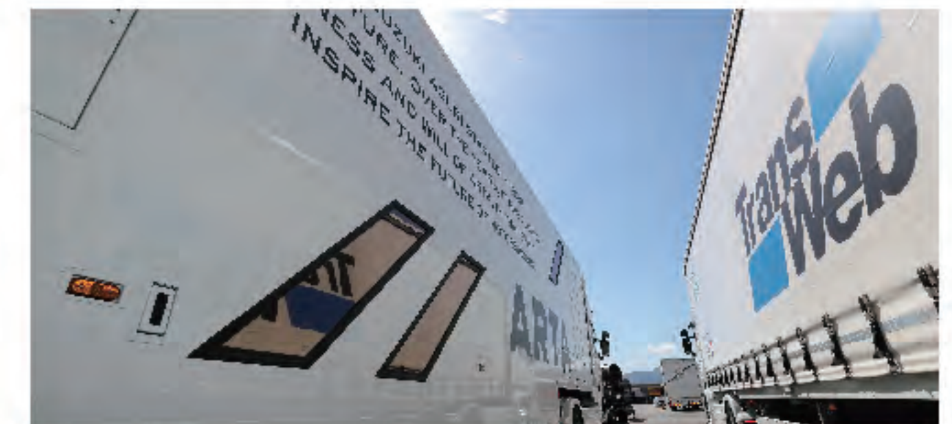
A special BTO transporter does not only accommodate tools and equipment but team members (Team ARTA).