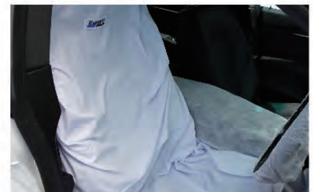
Perfect protection: Disposable seat covers and floor mats.