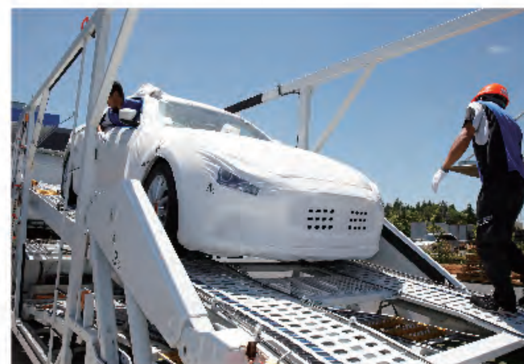
Safety and security are the priority number one! The highest possible care and attention are required during loading and unloading processes, in which the occurrence of the accident is highly likely.