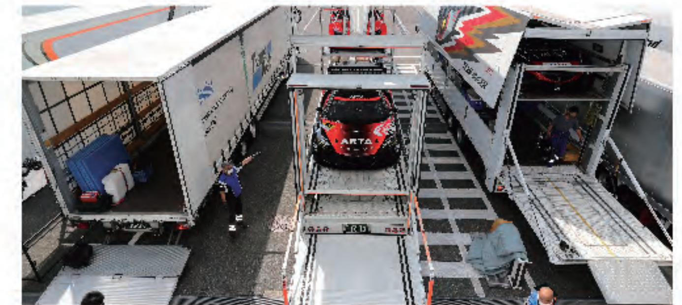
Communications with team members are the important tool (Team ARTA).