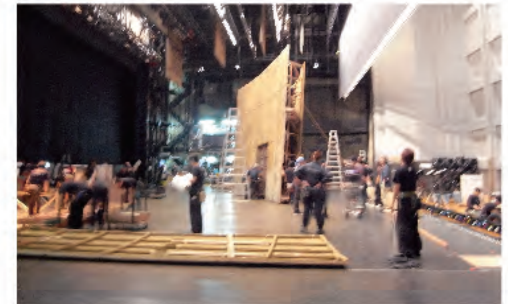
Close communications with event organizer are highly important.

One example: TransWeb is offering the fully covered services for the regular performance of a well-known ballet company, including back-stage support of installation, breakdown and temporary storage.