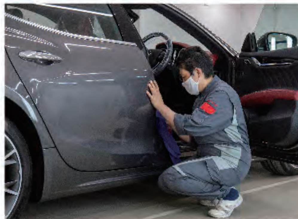
The PDI includes a number of inspections and tests.