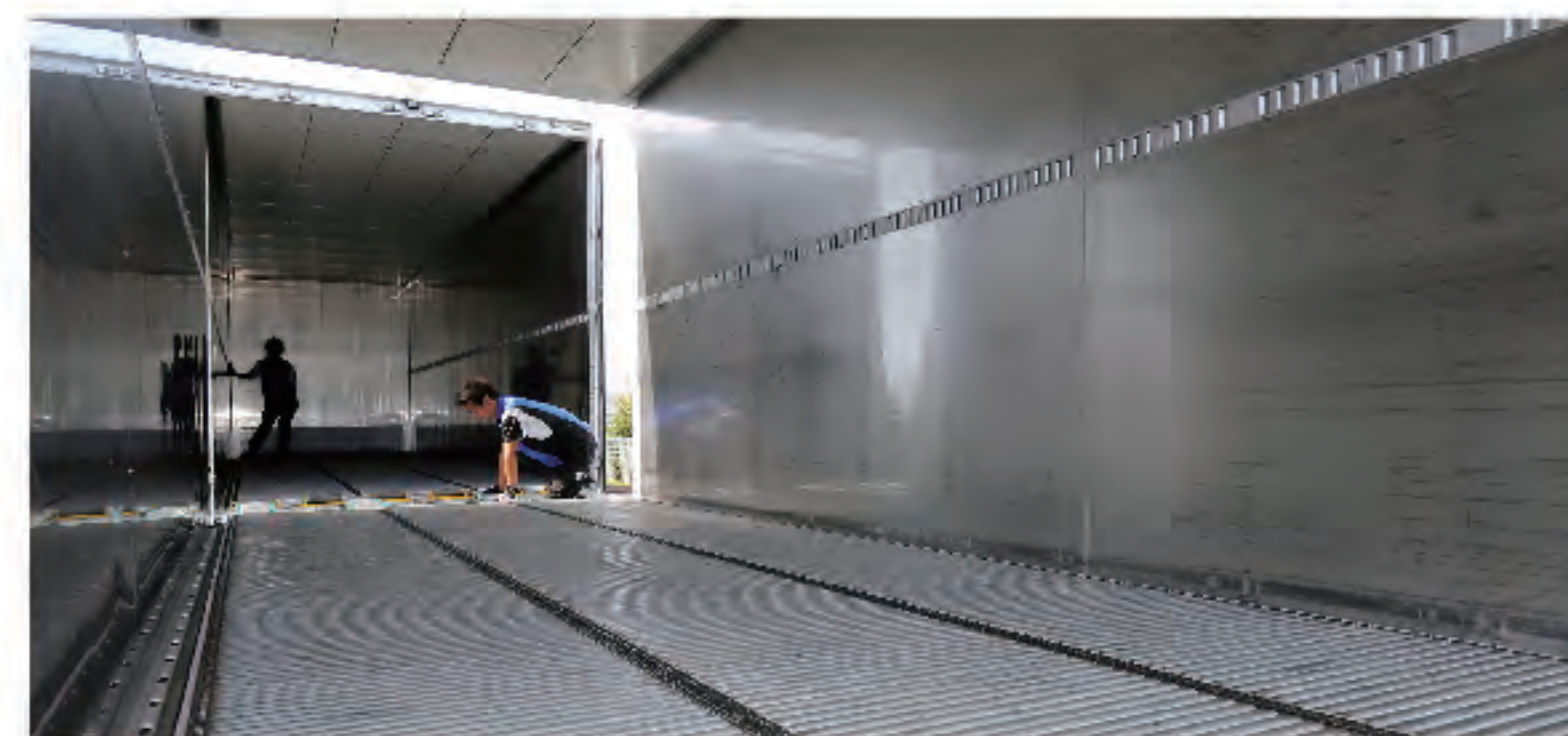
The purpose-built transporter provides dual-fold advantages; more containers and reduced transportation costs.