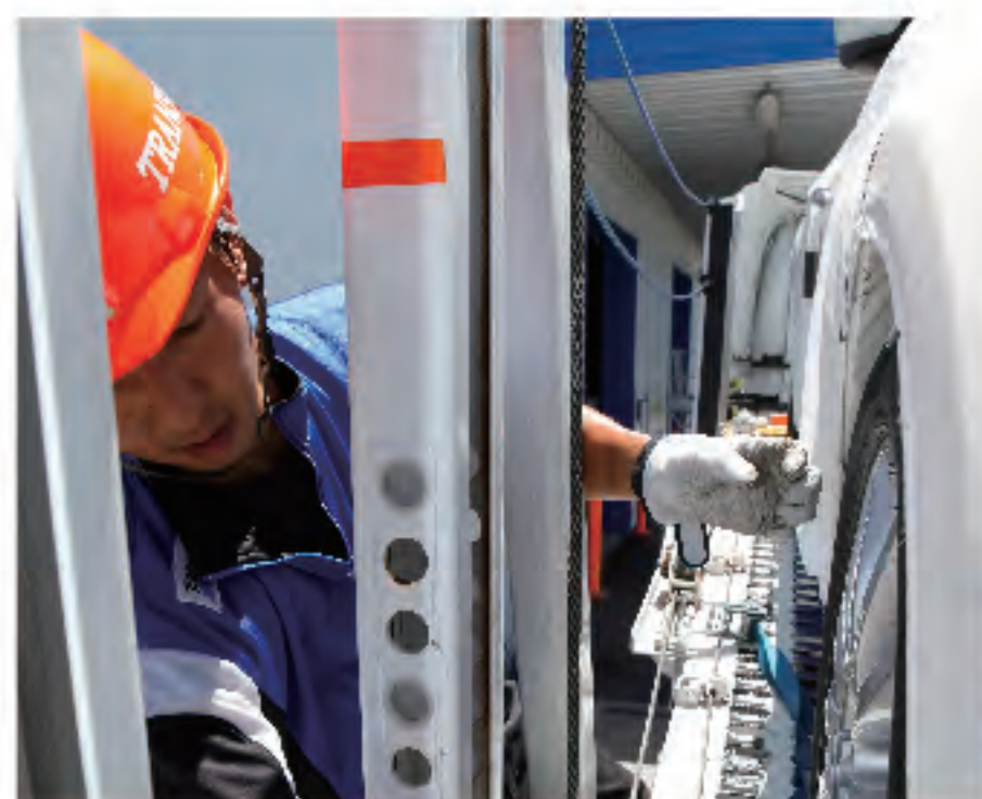
All the areas calling for caution are highlighted in bright orange. This color marking makes everyone attentive to the possible risk.